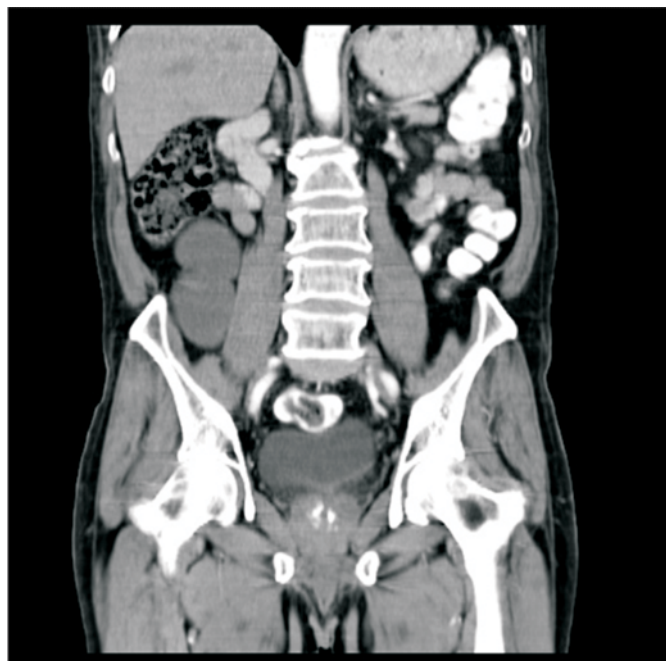
Legend 1: CT scan showing abdominopelvic retroperitoneal cystic mass lateral to right psoas muscle and anterior to right iliacus muscle.