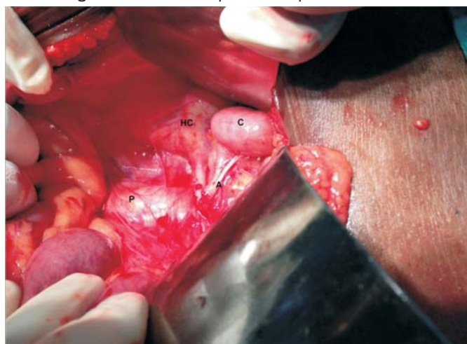
Figure 2: Intraoperative picture showing, a 12cm x 10cm cystic mass, lateral to right psoas muscle and anterior to right iliacus muscle.